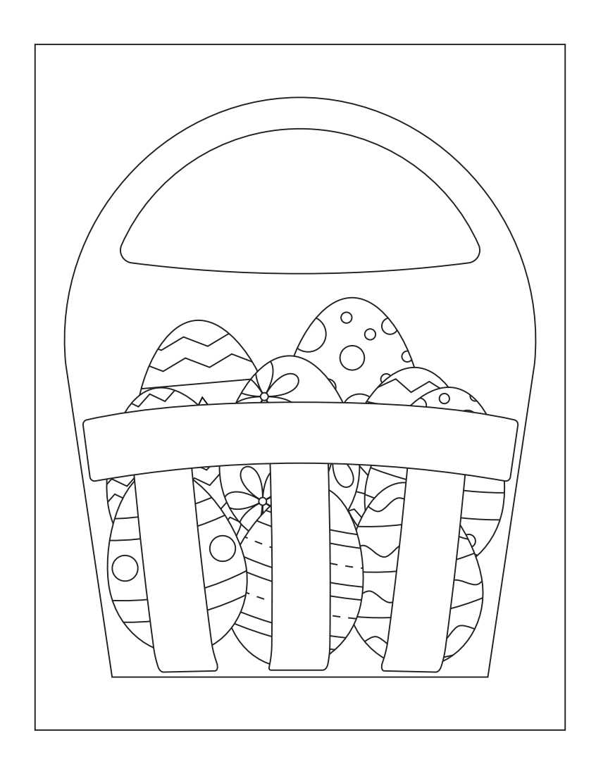
Finished product example